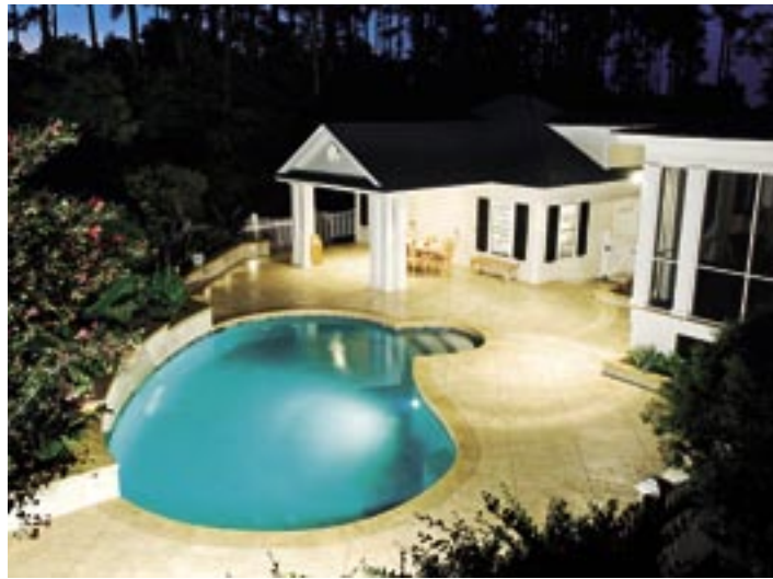
An example of Classic Remodeling inside and out. This pool surround, with water fall, and pool house are lighted exquisitely to create a beautiful space for both family fun and entertaining guests.